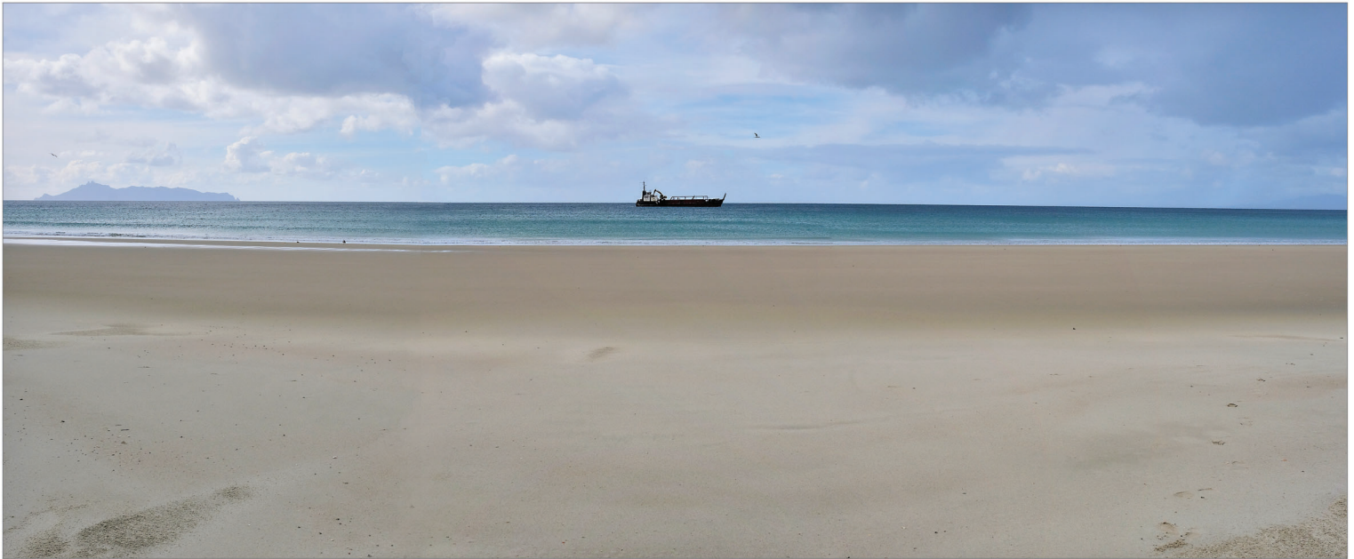
McCALLUM BROTHERS LIMITED SAND VIEWPOINT 9. (PHOTOMONTAGE) EXTRACTION RENEWAL APPLICATION Looking from Pakiri Beach North (near the Tara Iti Golf Course) towards an enlarged Coastal Carrier at the near edge of Consent Area 2 Brown NZ Ltd (September 2019)