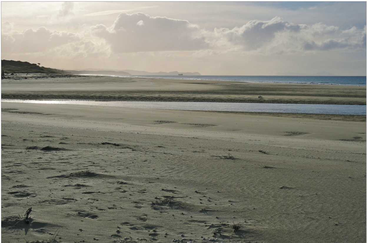
McCALLUM BROTHERS LIMITED SAND EXTRACTION RENEWAL APPLICATION VIEWPOINT 11. (PHOTOMONTAGE) Looking from near the edge of the Pakiri River & beachfront towards an enlarged Coastal Carrier within Consent Area 4 Brown NZ Ltd (September 2019)