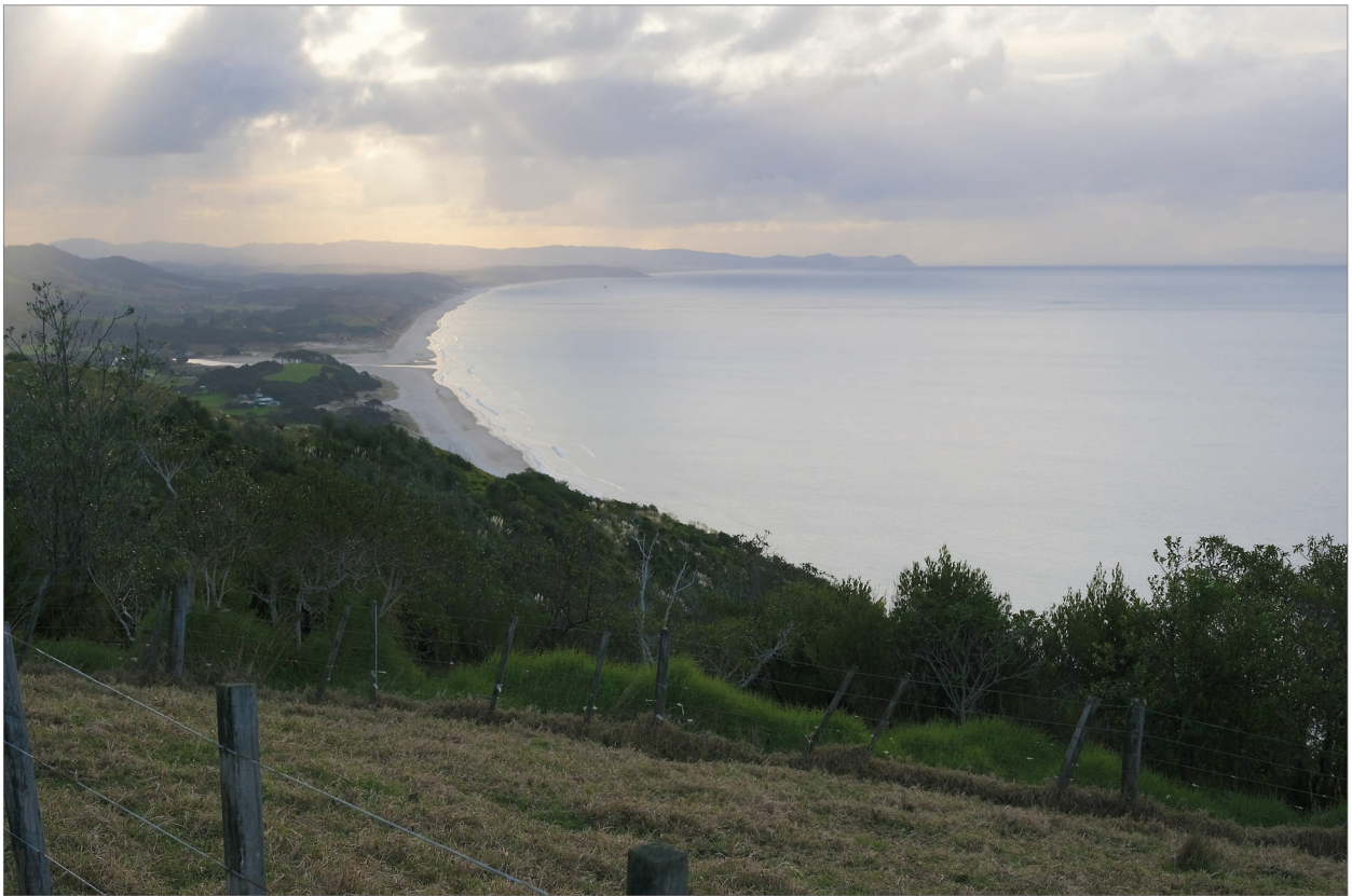
McCALLUM BROTHERS LIMITED SAND EXTRACTION RENEWAL APPLICATION VIEWPOINT 12. (PHOTOMONTAGE) Looking from M Greenwood Road (Pakiri Regional Park) towards an enlarged Coastal Carrier within Consent Area 4 Brown NZ Ltd (September 2019)