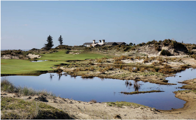
Looking towards the cleared area of the golf course and cottages from Te Arai Point